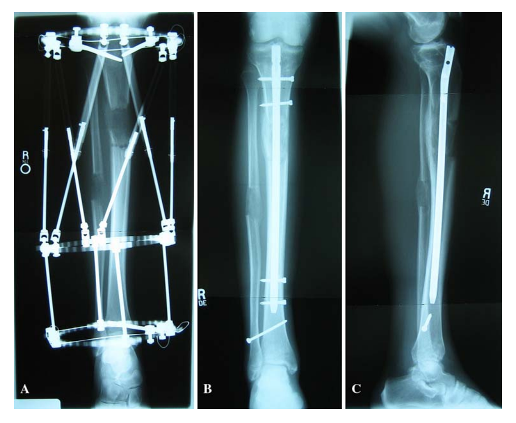
Fig. 3A–C This is an example of a 45-year-old man who underwent 5 cm lengthening. ( A ) This is an anteroposterior (AP) radiograph at the end of distraction. ( B ) This is an AP radiograph 8 weeks after

placed Steinmann pin was used to localize the optimal location for nail entry in the proximal tibia. This was performed with biplanar fluoroscopy and care was taken to avoid contact with previously placed external fixator pins. A 2-cm incision was made and the patella tendon incised longitudinally. A 10-mm cannulated drill was used to open the IM canal. The guide wire was passed across the regenerate and into the distal fragment ending at the syndesmosis screw. Serial reaming was performed until cortical chatter was achieved and a nail 1 mm smaller inserted. We ensured the maximum amount of reaming particles was retained within the tibia. We did not open the regenerate site and we did not remove any reaming particles. One proximal interlocking screw was inserted using a special jig that allowed clearance of the proximal ring (Fig. 1C-D). The second proximal interlocking screw and the two distal interlocking screws were placed using a freehand technique. Surgical wounds were irrigated and closed and covered with betadine sponges. The external fixator was then removed without risk of tibial displacement or shortening. The pin sites were irrigated but not curettaged and not closed. The surgical wounds and pin sites were covered with a dry sterile