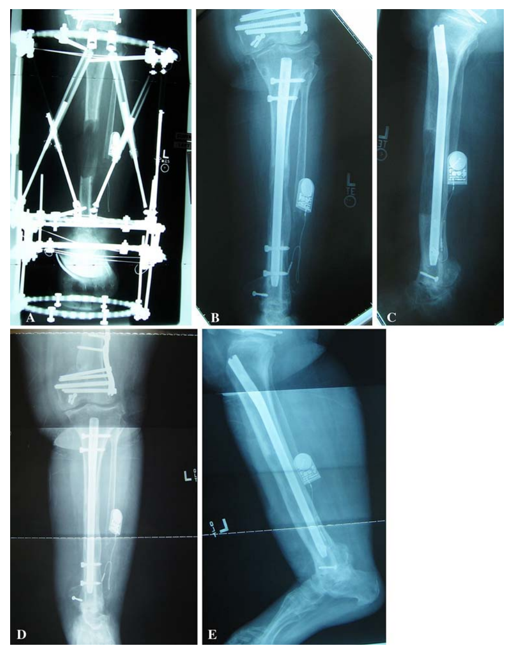
Fig. 4A-E This is an example of a 55-year-old woman who underwent ankle fusion and 10 cm lengthening for a segmental bone defect. (A) This is an AP radiograph at end of 10 cm distraction; the ankle fusion is stabilized more distally. (B) This is an AP radiograph 4 months after insertion of the intramedullary nail. (C) This is a lateral radiograph 4 months after insertion of the intramedullary nail. (D) This is an AP radiograph 9 months after insertion of the intramedullary nail. (E) This is a lateral radiograph 9 months after insertion of the intramedullary nail.